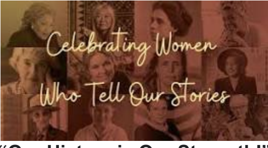
"Our History is Our Strength!"

The National Women's History Alliance, which spearheaded the movement for March being declared National Women's History Month, has announced the women's history theme for 2023, " Celebrating Women Who Tell Our Stories ."